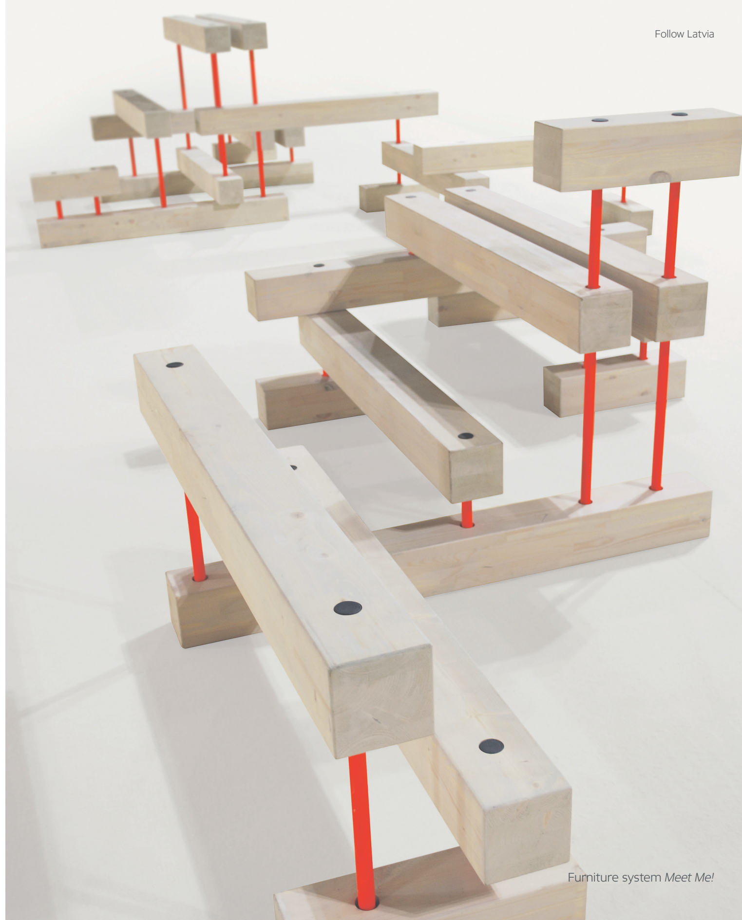
Furniture system Meet Me!